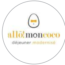
Allô! Mon Coco